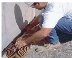
FOOTING AND WALL JOINTS